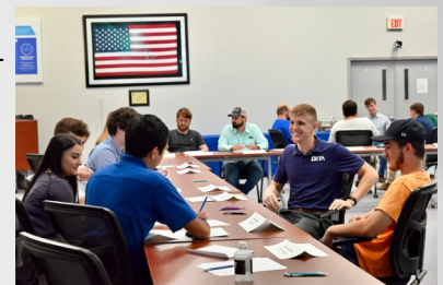
Interns from the Crest Industries Family of Businesses participate in small groups during National Intern Day.