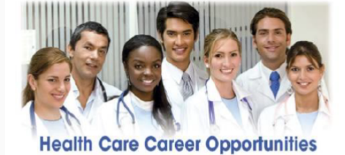
Health Care Career Opportunities